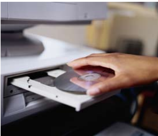
A single install loads a complete structural solution ready to run

MultiSUITE CAD provides everything a CAD package should in a single install.