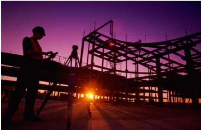
Typical Steel Framed Structure in MultiSTEEL CAD

All the methods and objects used are standard AutoCAD so that users with AutoCAD or AutoCAD LT can share drawings with MultiDRAFT CAD Users.