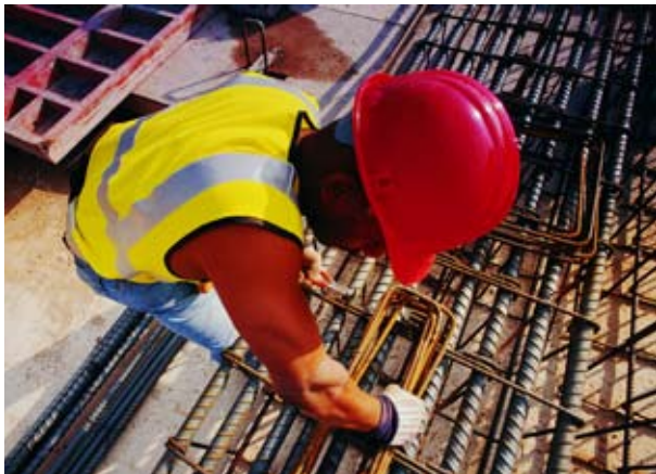
Detailing Reinforced Concrete is simplified in MultiREBAR CAD

MultiSTEEL CAD adds structural steel libraries and editing tools to the basic MultiDRAFT CAD system. See separate MultiSTEEL data sheet for full details.